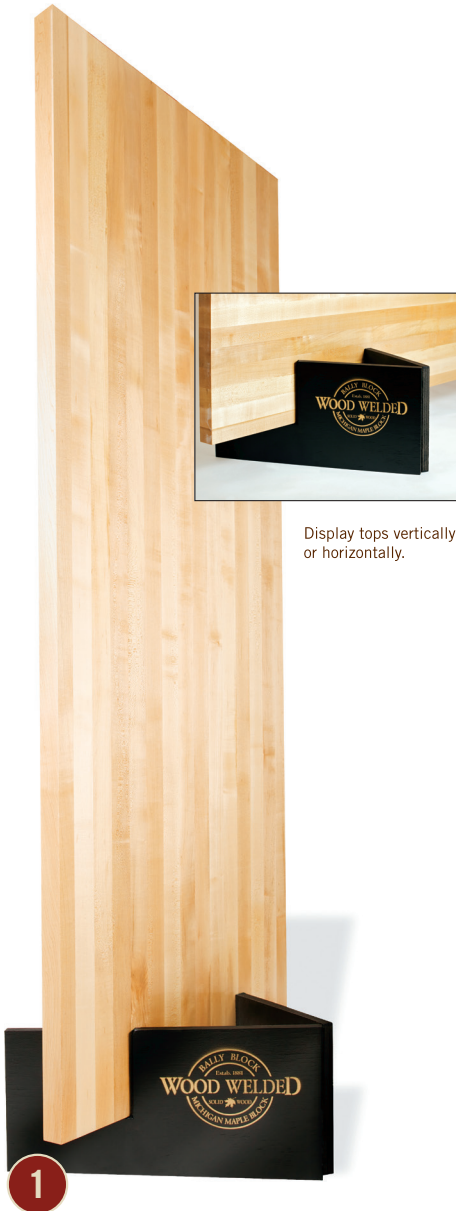
Display tops vertically or horizontally.